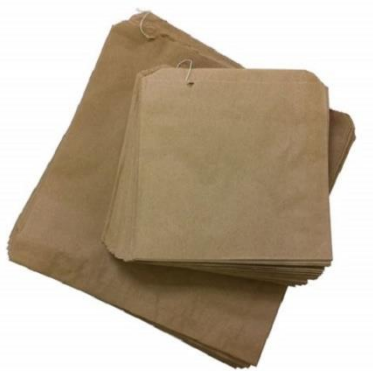
Take Away Bag